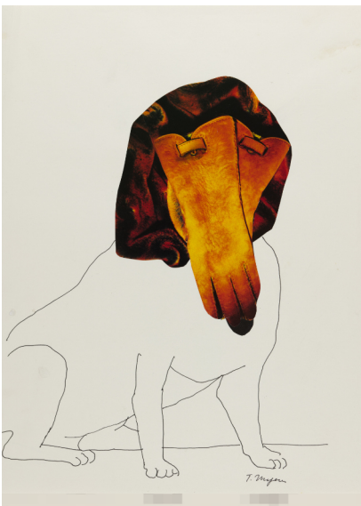
CAPTIONS 1 - Untitled, circa 1983 2 - Untitled, 2012 3 - Untitled, 2003