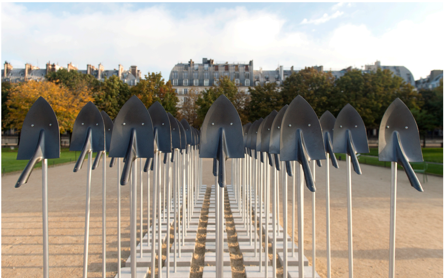
Army of Shovels, 2018

Without boundaries, without shame, without restrictions, Tomi Ungerer has never limited himself to a single medium nor a single mode of expression. He was always ready to tackle everything!