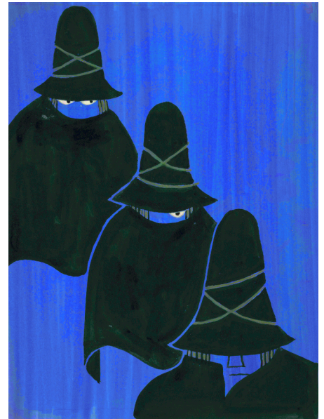
Three robbers, circa 1960