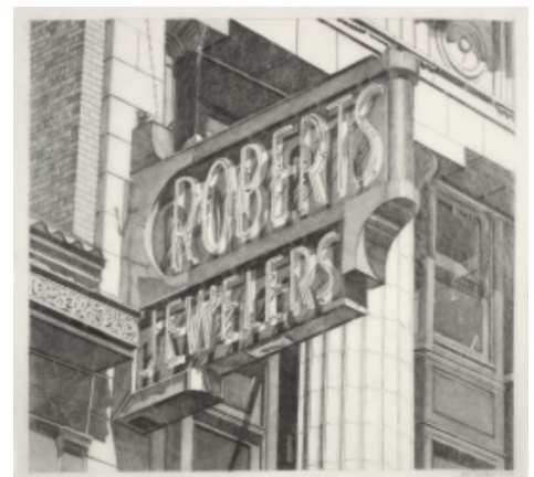
CAPTIONS 1 - 90 (Detail of Pool Car), 1989 2 - Catwalk, 2019 3 - Lone Star, 1991 4 - Roberts Jewelers, 2013